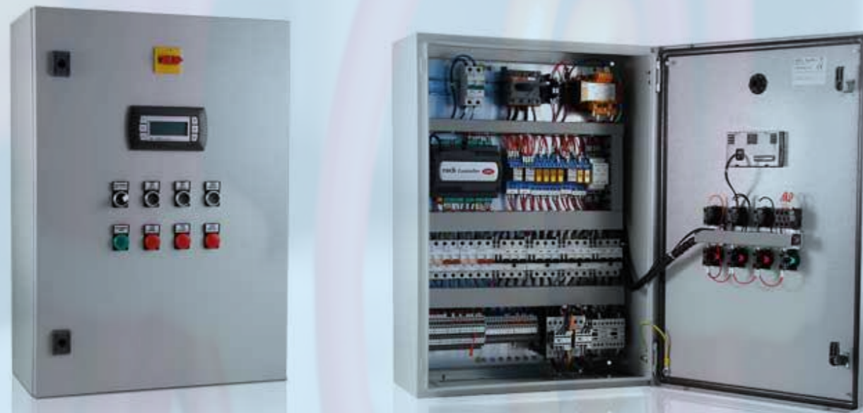
Electrical Parts & Panel Boards